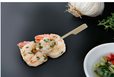
Spicy Chilli Prawns