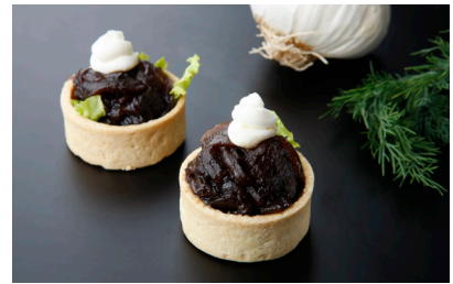
Caramelized Onion & Goat Cheese Tartlets