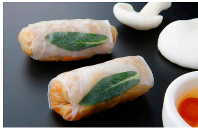
Rice Paper Rolls Choice of Vegetarian, Prawns and Thai Beef