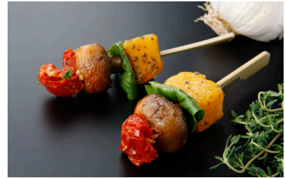
Antipasto Vegetable Skewers