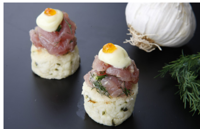
Smoked Tuna Wasabi Mayo & Caviar on Rosti