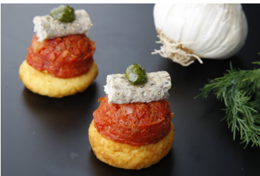
Olive Tapenade Fetta & Roasted Tomatoes on Potato Blinis