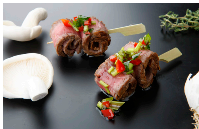
Thai Beef Skewers