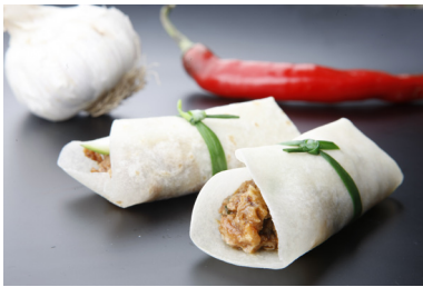
Peking Duck Pancakes Choice of Large and Small