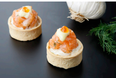
Salmon Gravalax Tart