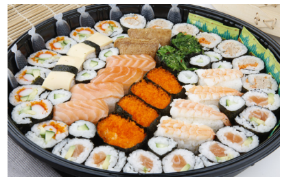
Assorted Sushi Platter